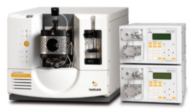
A complete system for only $98K USD