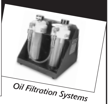
Vacuum Inlet Traps

MV Products offer you a full line of oil mist eliminators, vacuum inlet traps, oil filtration systems and other quality vacuum products designed to assure your vacuum pumps a long life and you a clean and healthy environment.