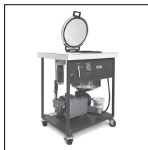
Vacuum Degassing Chambers