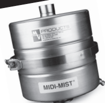
Oil Mist Eliminators