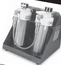
Oil Filtration Systems

MV Products offer you a full line of oil mist eliminators, vacuum inlet traps, oil filtration systems and other quality vacuum products designed to assure your vacuum pumps a long life and you a clean and healthy environment.