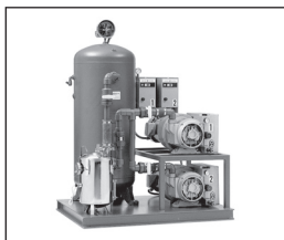
Central Source Vacuum System