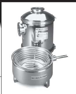
Vacuum Inlet Traps