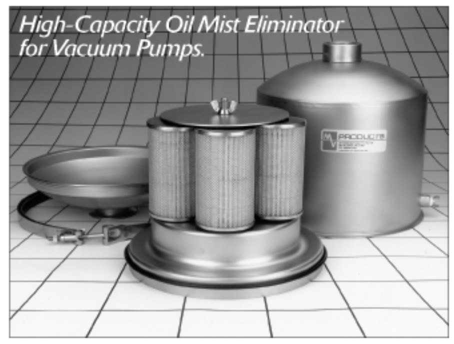
MV VISI-MIST Oil Mist Eliminator for Smaller Pumps