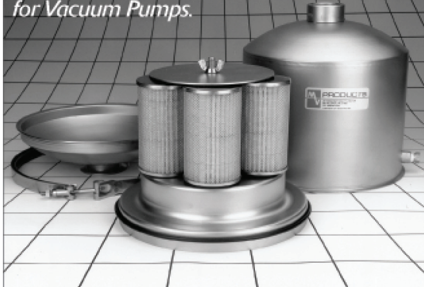
MV VISI-MIST Oil Mist Eliminator for Smaller Pumps

High-Capacity Oil Mist Eliminator for Vacuum Pumps.